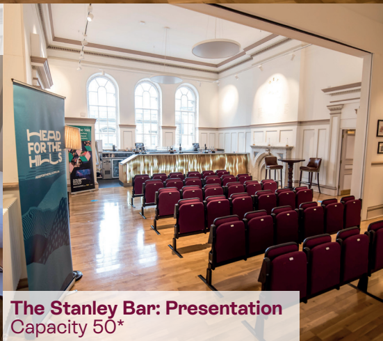
The Stanley Bar: Presentation Capacity 50*