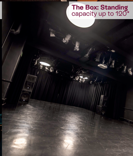
The Box: Standing capacity up to 120*