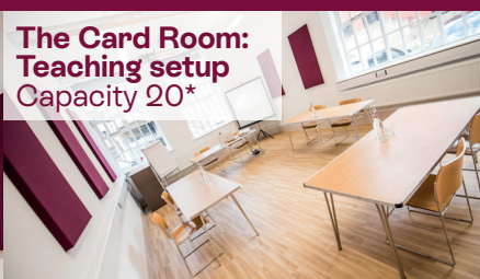
The Card Room: Teaching setup Capacity 20*