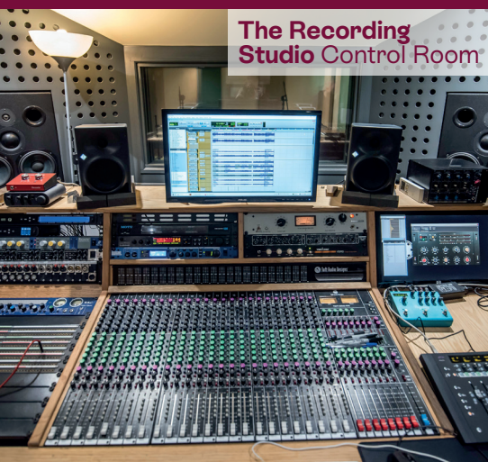
The Recording Studio Control Room