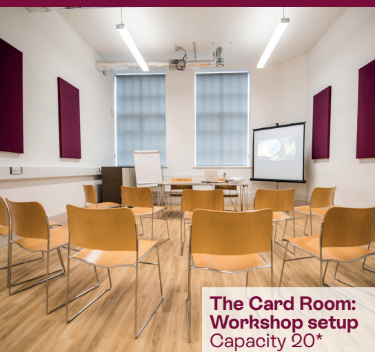
The Card Room: Workshop setup Capacity 20*