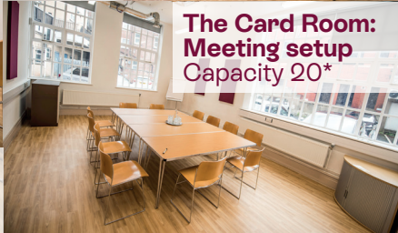
The Card Room: Meeting setup Capacity 20*