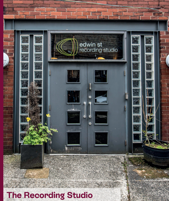
The Recording Studio

The Recording Studio is located behind the building, our professional recording facility features quality recording equipment and a superb sounding live room. We provide a full recording service, including bands, ensembles, vocalists and choirs, along with voice-over and voice to picture. We also provide a professional, radio ready mixing and mastering service, both attended and online, along with recording workshops and free sessions for young people. A link from the main theatre means that performances can be recorded in the studio.