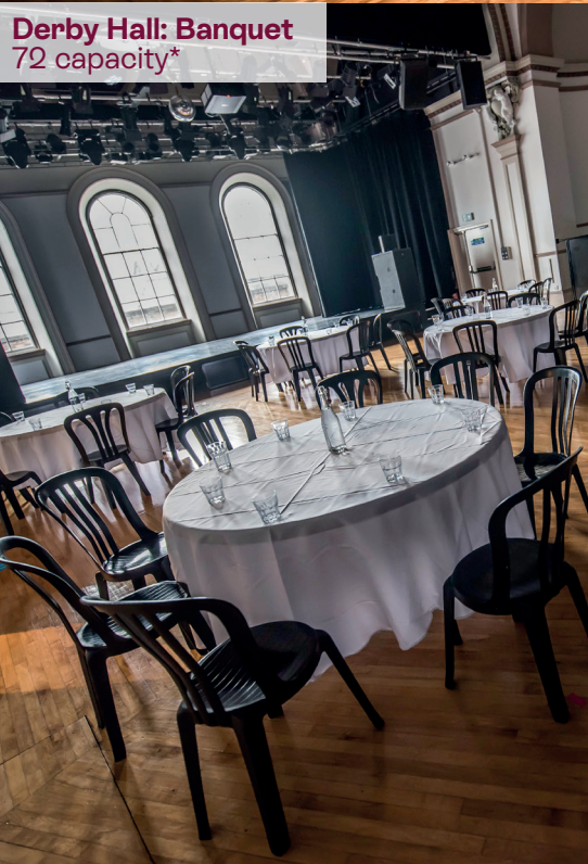
Derby Hall: Banquet 72 capacity*