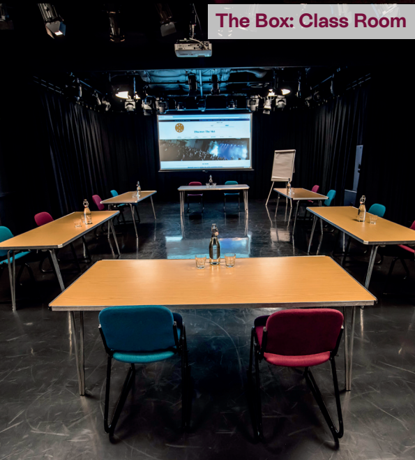
The Box: Class Room