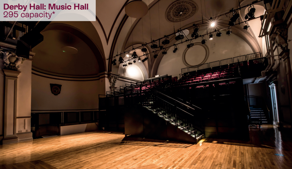
Derby Hall: Music Hall 295 capacity*