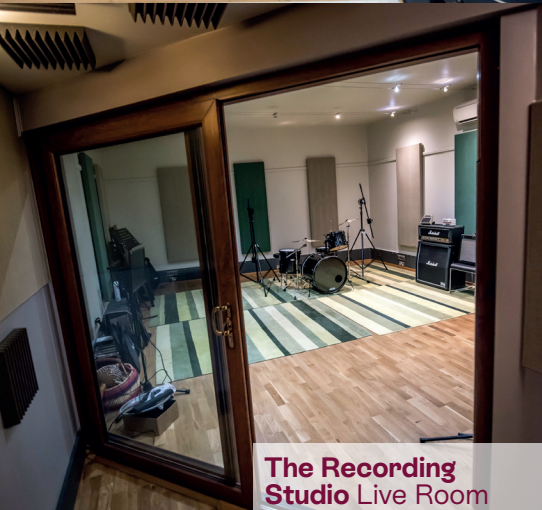
The Recording Studio Live Room