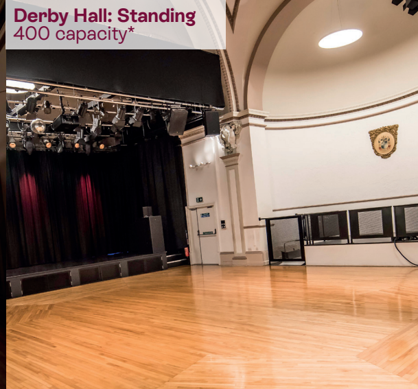
Derby Hall: Standing 400 capacity*