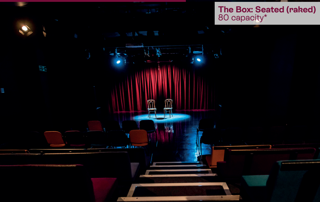
The Box: Seated (raked) 80 capacity*