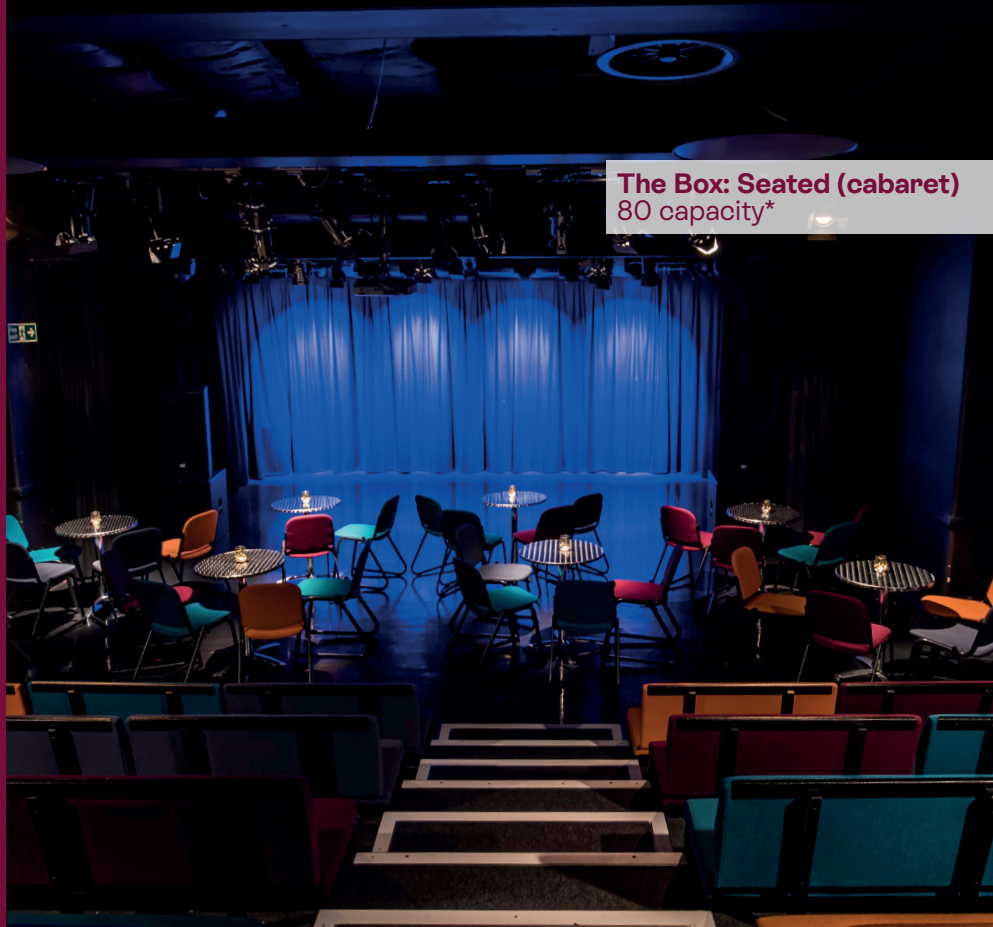
The Box: Seated (cabaret) 80 capacity*

This space includes technical, front-of-house, and ticket office staffing.