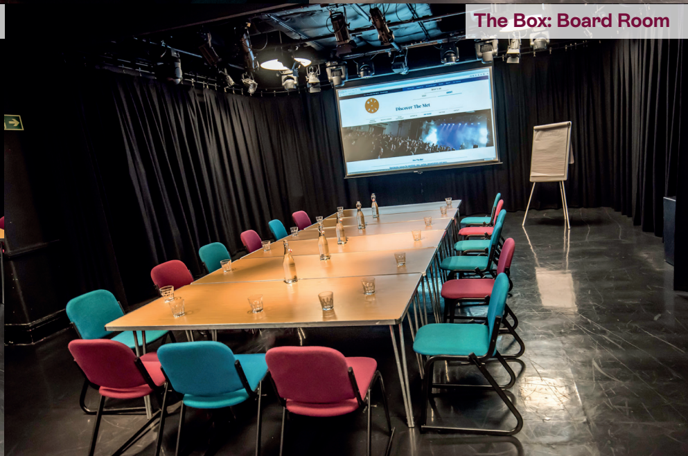
The Box: Board Room