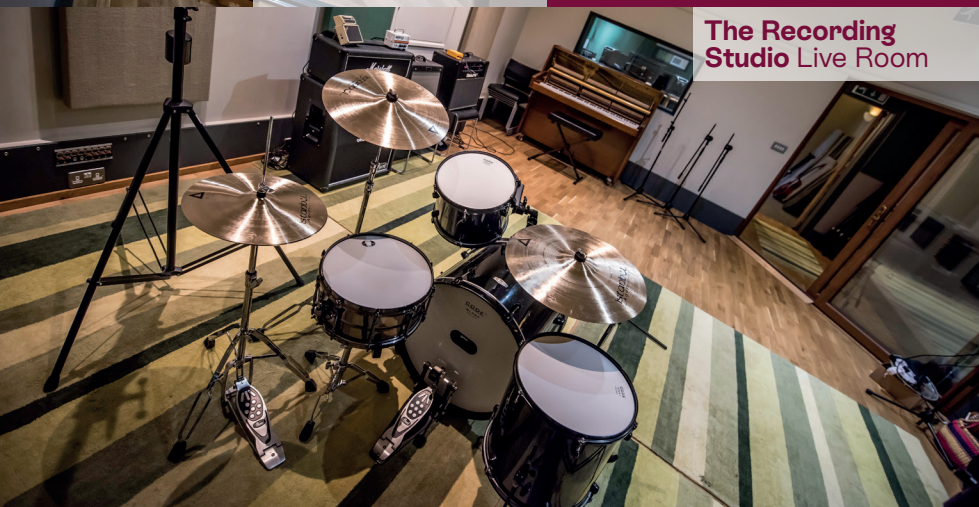
The Recording Studio Live Room