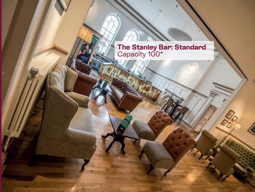
The Stanley Bar: Standard Capacity 100*

is a beautiful, light and airy space with informal seating and a fully stocked bar. Located on the first floor adjacent to the Derby Hall, it is suitable for informal meetings and gatherings, networking events, or small exhibitions or presentations.