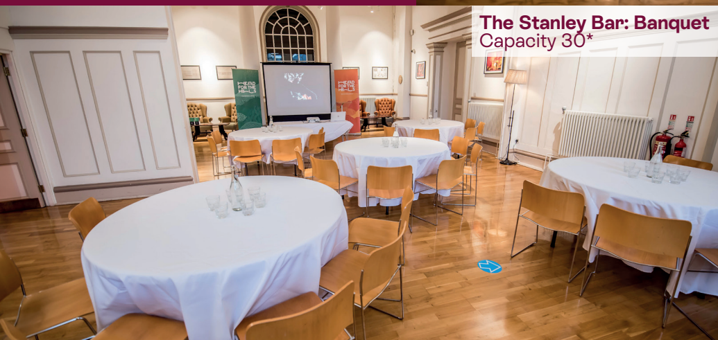
The Stanley Bar: Banquet Capacity 30*