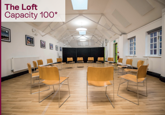
The Loft Capacity 100*

The Loft is a large, light and airy space located behind the main building above The Met's recording studio. It is ideal for larger meetings, theatre and dance rehearsals, workshops and presentations. Please note that there is no level access to this space.